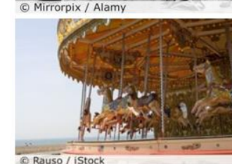
Children liked to ride on the carousel at the fairground.