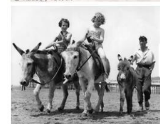
Children liked to ride on the donkeys at the seaside.