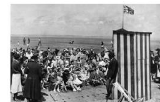
Children liked to watch Punch and Judy shows at the seaside.